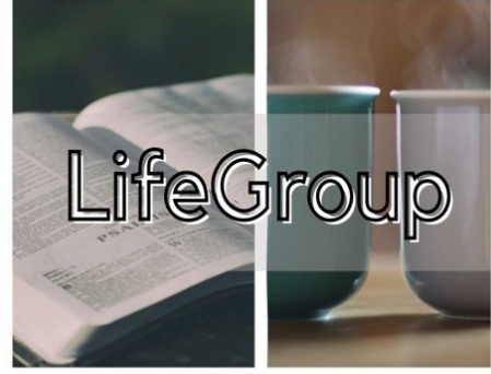
"I have come that they might have life" John 10:10